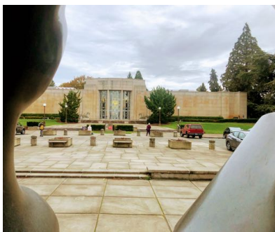
View of Seattle Asian Art Museum through the Black Sun sculpture (left)