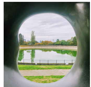
View of the park through the Black Sun sculpture (right)

It was a beautiful autumn day, as you can see from this picture of the museum park.