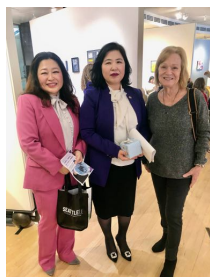
Eunji Seo, Consul of Republic of Korea in the center