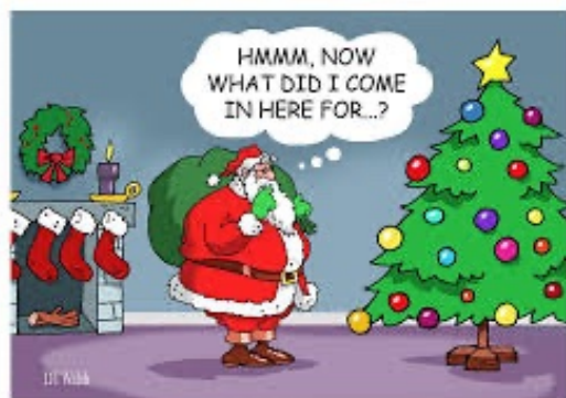
Santa has a senior moment