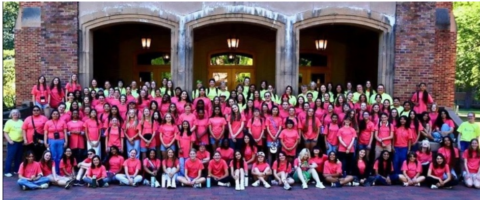
July 2025 Camp at Pacific Lutheran University

Or mail a check payable to AAUW-WA SPF to AAUW-WA SPF, P.O. Box 1665, Bellevue, WA 98009-1665. Write "AAUW Highline" on the message line of your check.